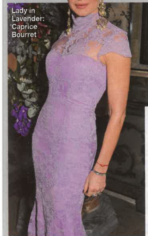
Lady in Lavender: Caprice Bourret