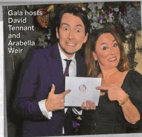
Gala hosts David Tennant and Arabella Weir